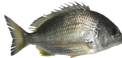
Yellow finned Bream ( Acanthopagrus australis )