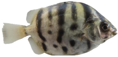
Striped Butterfish ( Selenotoca multifasciata )