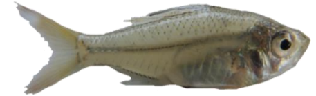
Estuary Perchlet ( Ambassis marianus )