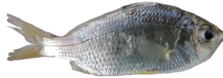
Silverbidy ( Gerres subfasciatus )