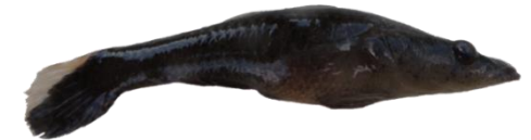
Crimsontip Gudgeon ( Butis butis )