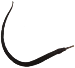
Mangrove Pipefish ( Hippichthys penicillus )