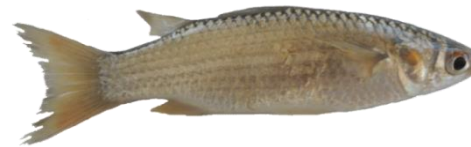
Sea Mullet ( Mugil cephalus )