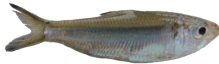
Southern Herring ( Herklotsichthys castelnaui )