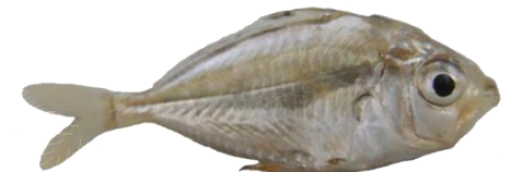
Ponyfish ( Leiognathus species)