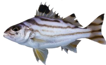
Crescent Perch ( Terapon jarbua )

This is a one page guide. Species are not shown to scale. Many are juvenile specimens reflecting the importance of saltmarsh and mangrove habitat within their life cycle. Please refer to the fish identification guide for descriptions and sizes.